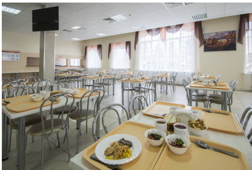
Figure A1. A quarter of Kazan’s educational institutions offer halal meals to children: 131 educational institutions of Kazan, including 38 schools and 93 kindergartens, are provided with halal-cooked meat products (data from the Department of Food and Social Nutrition of the capital of Tatarstan).