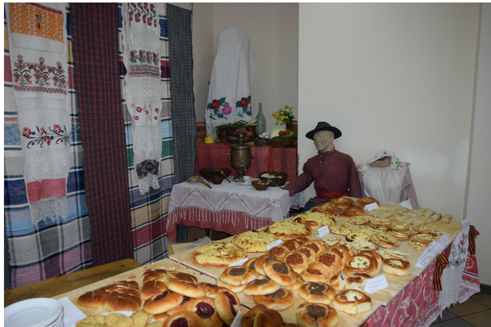
Figure A2. “Days of Udmurt Cuisine” in the Sharkansky District.